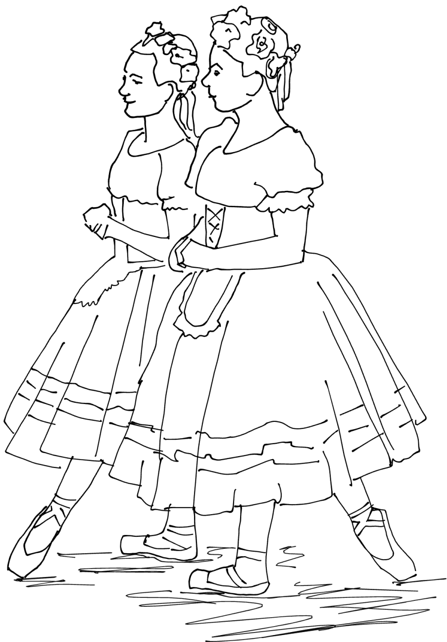
THE VILLAGERS AWAIT THE CORONATION