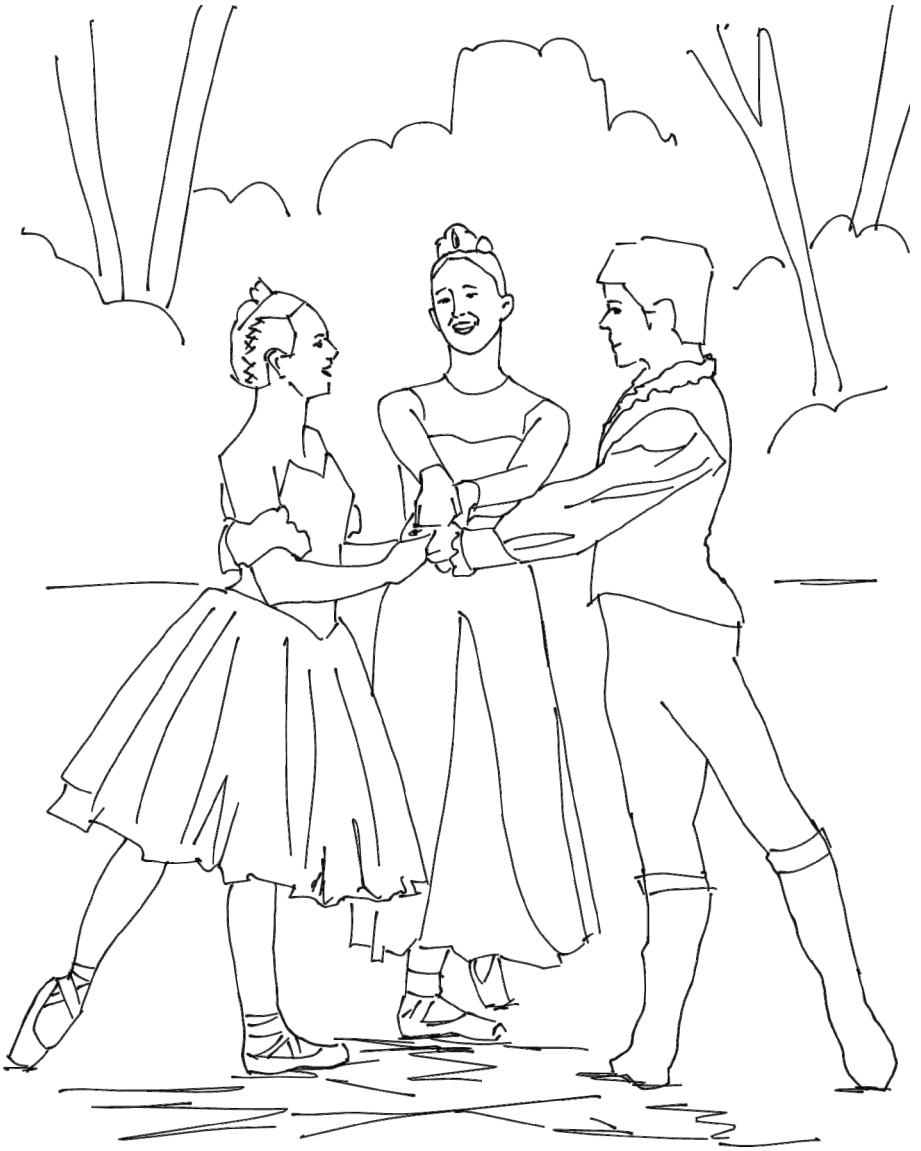
GERDA, ELSANDRA AND KAI DEFEAT THE TROLL KING