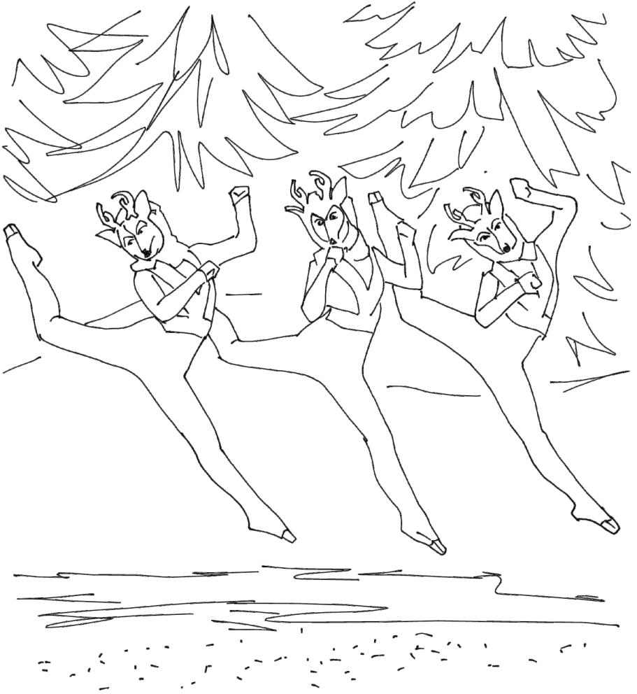
THE REINDEER ESCAPE FROM GERDA AND KAI