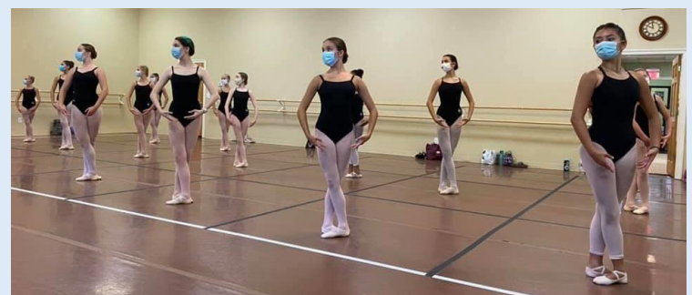
MMB senior company class during COVID-19 pandemic

MMB directors continue to pursue opportunities to foster interest in classical ballet during the COVID-19 outbreak. These include posting of ballet activity pages for download from our website, initiation of a ballet blog for company members and possible livestream of performances for the coming season.