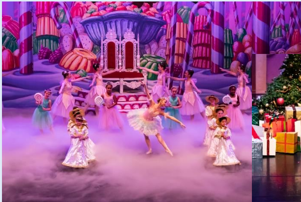
Scenes from recent productions of "The Nutcracker"