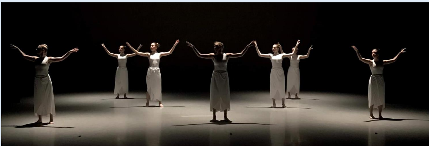
MMB senior company members perform "Interrupted" during 2020 Regional Dance America adjudication