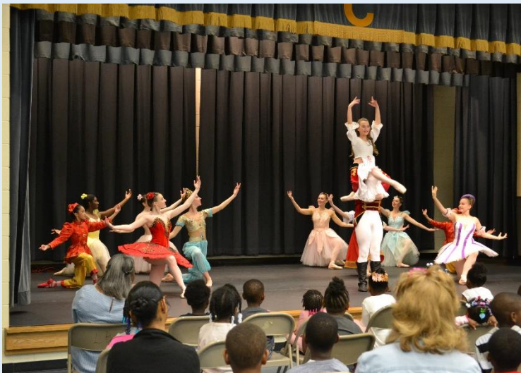
"The Nutcracker" at Camden Elementary in November 2019