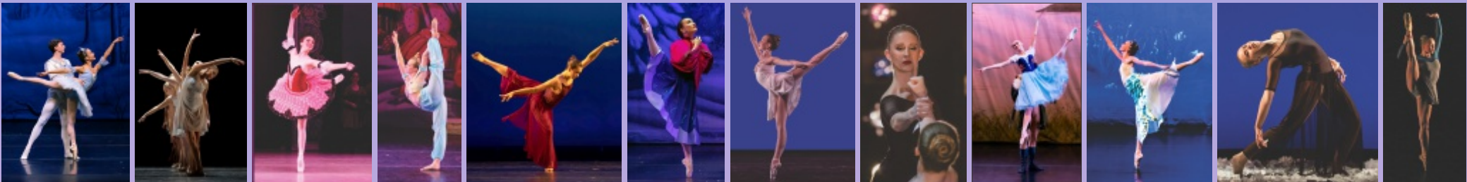
Pictured are MMDA students in productions during the past seven years